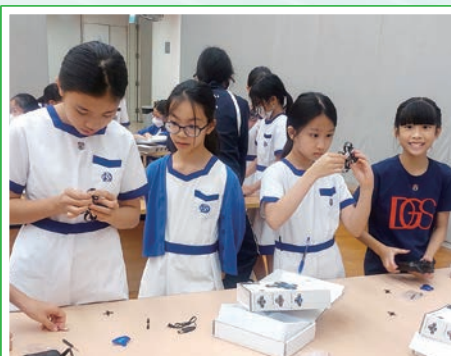
Aviation STEM Day - The Primary 6 girls learned about basic flight theory and flight control of aircrafts as well as aerodynamics through a range of activities conducted by professional pilots.