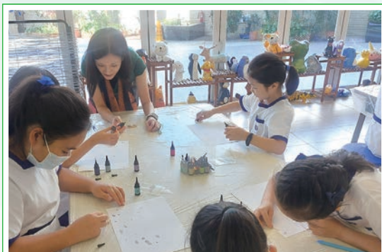
A replica of Cloisonne ( 仿景泰藍 ) handicrafts making class - Through this activity, the Primary 4 and 5 girls learned about their role in conserving intangible cultural heritage.