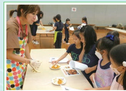
Mooncake Making and Tasting - With the facilitation of our parent helpers, the Primary 2 girls participated in the creation of egg custard mooncakes and snowy mooncakes.